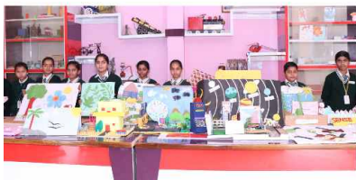
Art & Craft Room